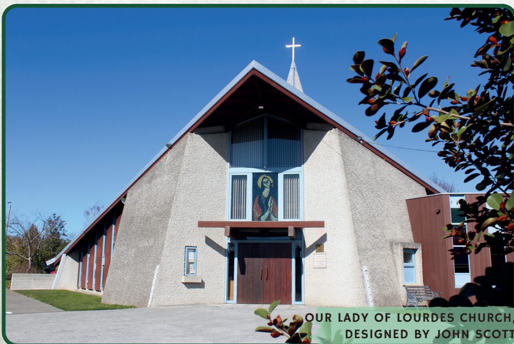
OUR LADY OF LOURDES CHURCH, DESIGNED BY JOHN SCOTT

The heavy wooden beams supporting the roof converge at the centre, forming a star-like pattern that draws the eye upward. On the northern sides of the steeple, acrylic slats cast dramatic light onto the crucifix and altar, enhancing the spiritual experience.