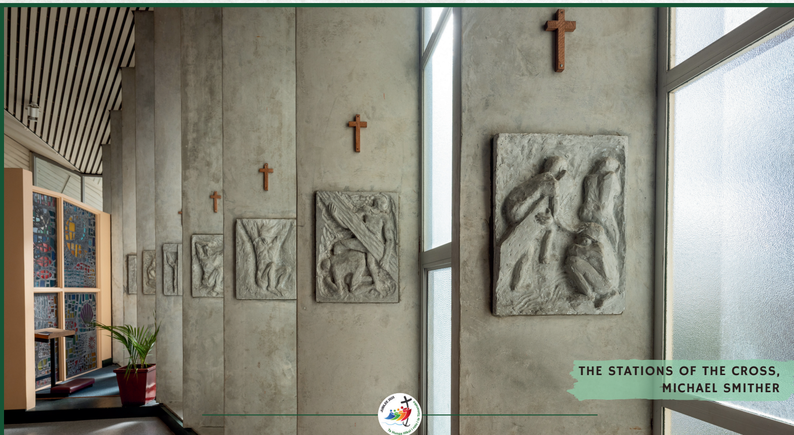
THE STATIONS OF THE CROSS, MICHAEL SMITHER

In the First Station, Jesus is Commend to Die , the artist used a photo from the Vietnam War of a prisoner on his knees, hands tied behind his back - a powerful image.