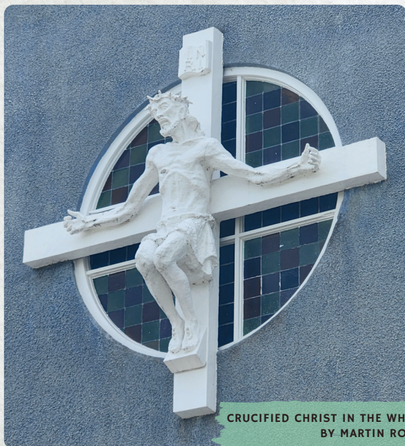
CRUCIFIED CHRIST IN THE WHEEL WINDOW BY MARTIN ROESTENBURGT

History sourced from https://publicart.nz/