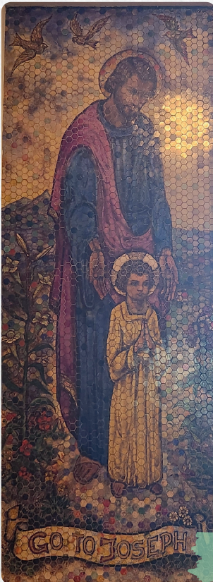
MOSAIC OF ST JOSEPH BY MARTIN ROESTENBURGT